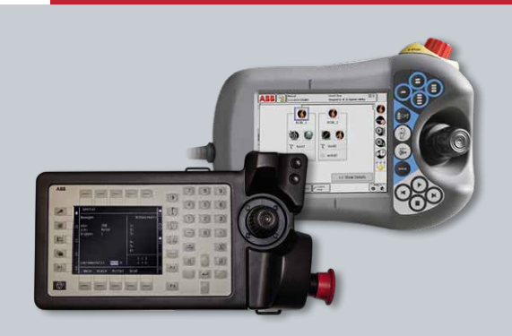
ABB FlexPendant Units Teach Pendant Units